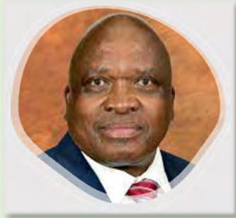
Dr MJ Phaahla