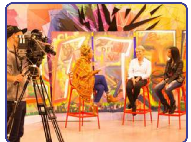
"Lienkie se Longe" drama op SAUK 2 uitgesaai