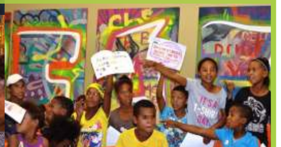
Art activities at Esselen Park Library.