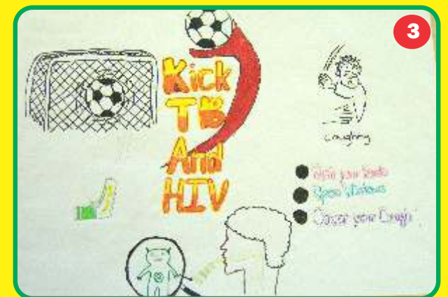
Inge Syster, Prospect Primêr