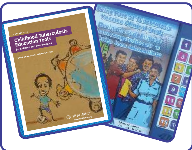
TB Opvoedkundige hulpbronne TB Educational resources