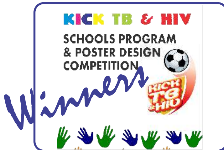
Wenners van Kick TB-Plakkaatkompetisie Winners of Kick TB Poster Competition