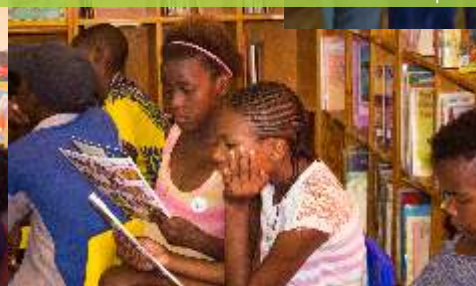
Children enjoying story reading.