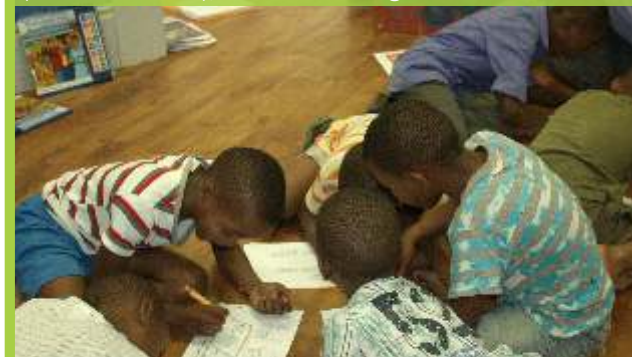
Avian Park Library: Participants at Avian Park library doing art.