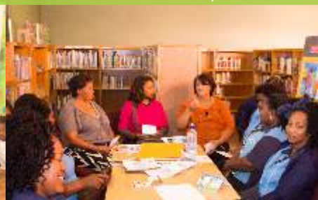
Workshop discussion at Zwelethemba Library with Hospice health workers.