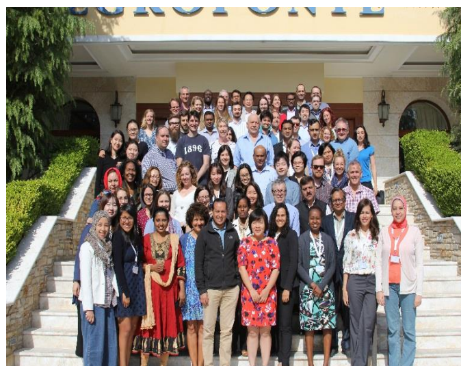
Above: Workshop participants.

The GBD investigators at IHME actively engage with collaborators in many countries globally and rely heavily on local collaborators to interpret local data, identify data sources, collect appropriate data, co-author papers, and critically review GBD methods and publications. With the new drive and funding from the Gates Foundation to extend the GBD statistics to subnational data, aiming for areas as small as 5x5 kilometres, the need for global collaboration has become more pressing. See the call for collaborators at: http://www.healthdata.org/gbd/call-for-collaborators .