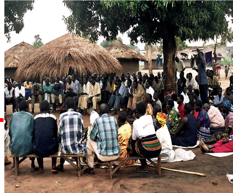
Community ( source online CC licence )