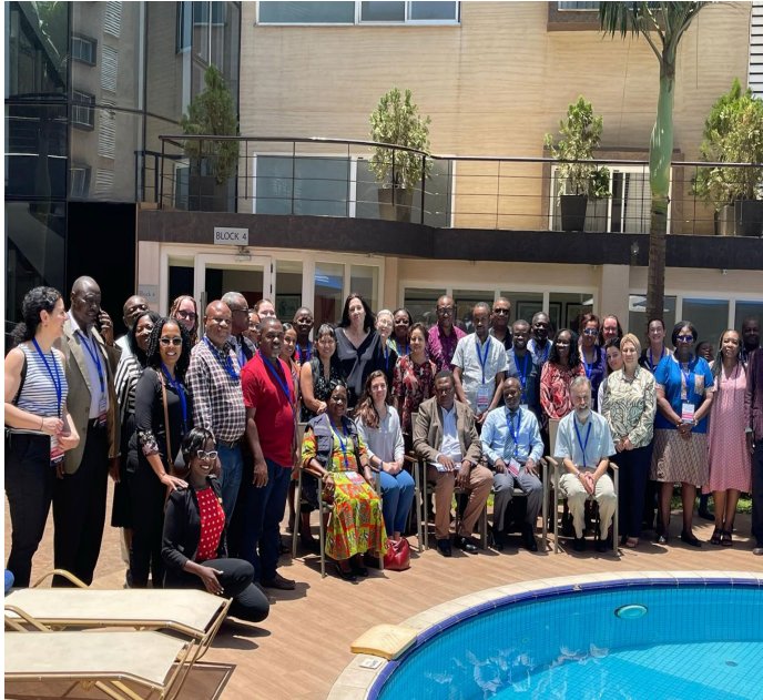
OptiMaP Research team