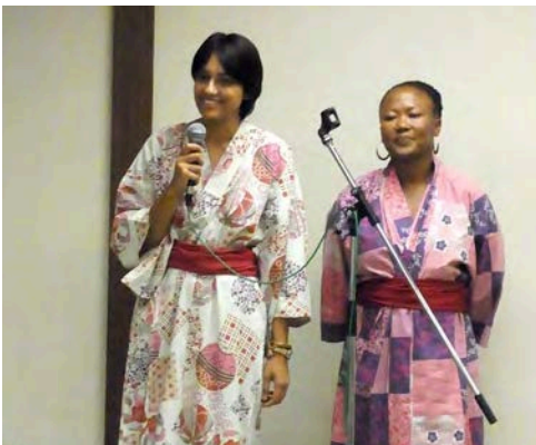
At the farewell banquet, we were all dressed in flowery Japanese robes, and the participants provided the entertainment - and South Africa led the way with an impromptu duet – a surprisingly good rendition of Shosholozza, with the audience even joining in!"

The doctoral and post-doctoral fellows hailed from Asia Pacific (Australia, Bangladesh, China, Egypt, Indonesia, Israel, India, Japan, South Korea, Malaysia, New Zealand, Philippines, Singapore, Thailand, Taiwan and Vietnam) and South Africa, who was invited for the first time. Each participant presented both a poster and a 1 minute oral summary of their work. Reyna received one of 5 prizes awarded for best poster presentation, with the judges praising the overall high quality of the work showcased at the meeting. In addition to their individual presentations, participants were also grouped into teams to deliver joint presentations on the theme of "Life sciences in the global future" – an exercise which proved to be a microcosm of the challenges and rewards involved in collaborations across cultures, languages and disciplines.