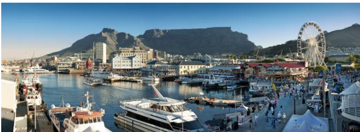
The V & A Waterfront