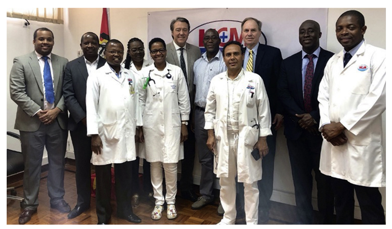
FIGURE 2. Cardiac Surgery Intersociety Alliance meeting with the cardiac surgery team and the Minister of Health—Mozambique.

note, we were screened at each airport we visited with temperature measurement or a travel and symptom questionnaire. With the ongoing suspension of in-person meetings, CSIA has been unable to publicly announce the final sites selected for endorsement, a necessary step before initiating fund-raising efforts for those sites. That is why the decision was taken to prepare a manuscript detailing the process employed and the outcome of that process, namely, the endorsement of the two sites listed in this publication.