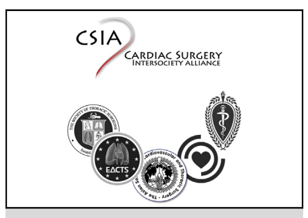
Cardiac Surgery Intersociety Alliance logos.

With an understanding that surgery is, and will remain, an integral part of the management of RHD, "The Cape Town declaration on access to cardiac surgery in the developing world" was unanimously adopted, signed, and published in all the major cardiothoracic journals. The Cardiac Surgery Intersociety Alliance (CSIA) was created along the guidelines of the first aim of the Cape Town Declaration to be the effector arm of the Cape Town Declaration to be the effector arm of the Cape Town Declaration. The CSIA is comprised of representatives from the major cardiothoracic societies (the Society of Thoracic Surgeons, American Association for Thoracic Surgery, European Association for Cardio-Thoracic Surgery and Asian