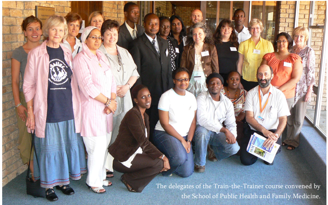
The delegates of the Train-the-Trainer course convened by the School of Public Health and Family Medicine.

In January, the Health and Human Rights Programme in the School of Public Health and Family Medicine hosted its 10th annual Train-the-Trainer course in Health and Human Rights.