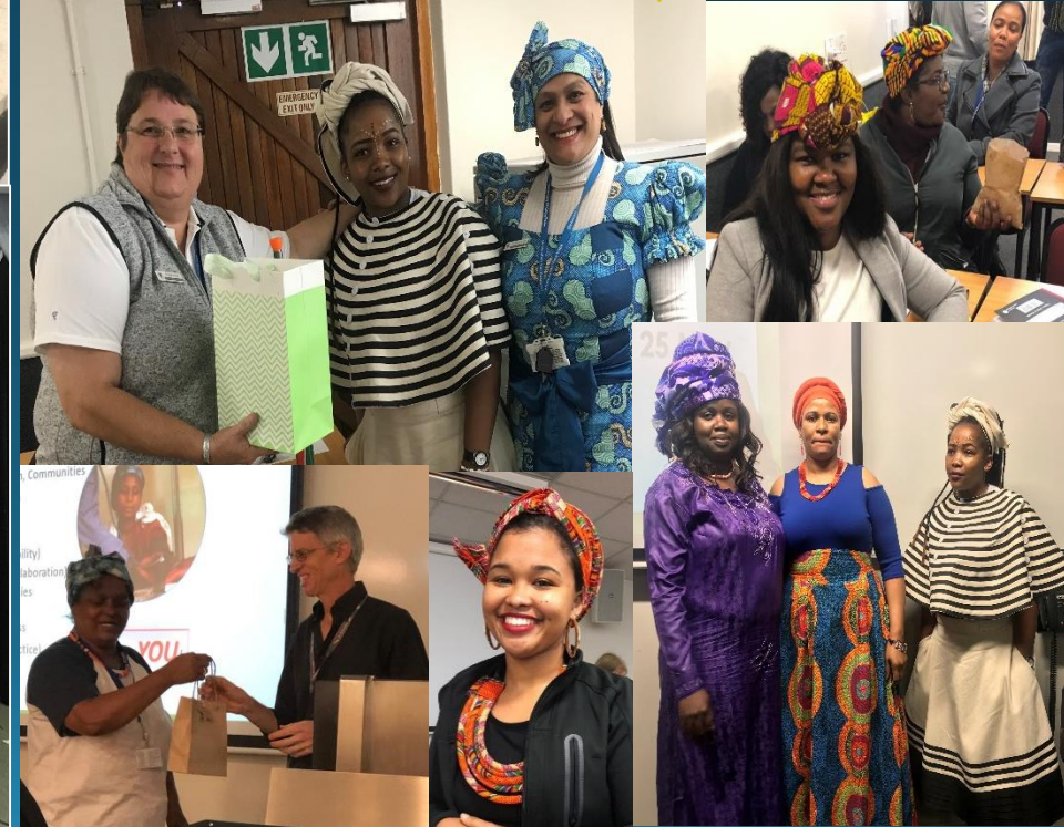
Below: Our PGDN students and staff dressed up to celebrate Africa month