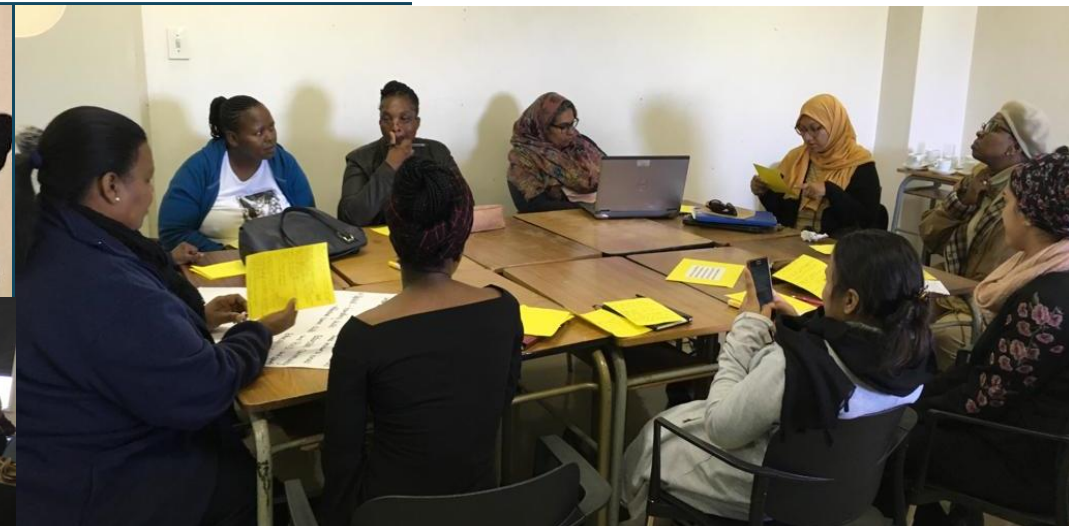
Pictures left/Above: DSD hosted a Research Dissemination Day – Research on Higher Certificate in Disability Practice (HCDP), on 22 May 2019. The focus was on research done on the HCDS and was well attended by therapists and programme managers from the WCDH, academics DHRS, UWC and alumni of the Higher certificate in Disability Studies Practice.

The day was divided into two sessions. In the first session research findings on the training and experiences of the HCDP graduates (Rehab Care workers). Presentations included the roles of the rehab care worker in the health system, in facilitating inclusion of people with disabilities in sport and their experiences of some of the barriers and facilitators in these roles. There was also a presentation on a tool that was developed to assist the Rehabilitation care worker in documenting information on rehabilitation and health needs of people with disabilities.