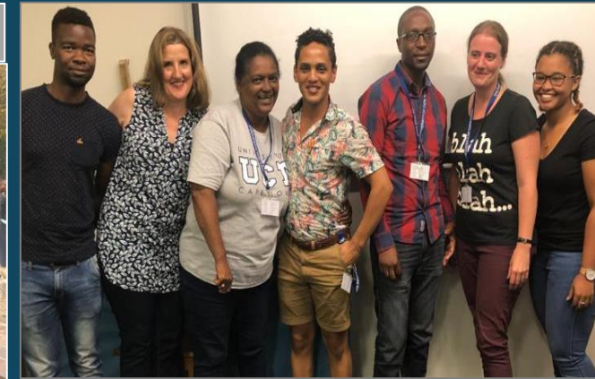
Left: 2019 PGDN Student committee